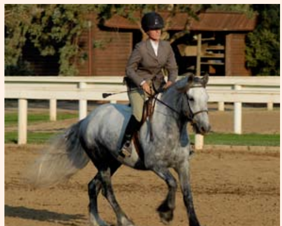
Bickerdike by Design "Dessie" wins the Ridden M&M class!