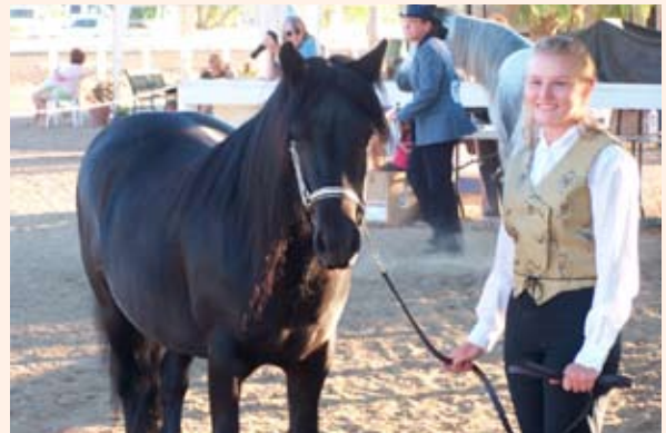
Laurelhighland Rose Petal wins the NPS America Championship!