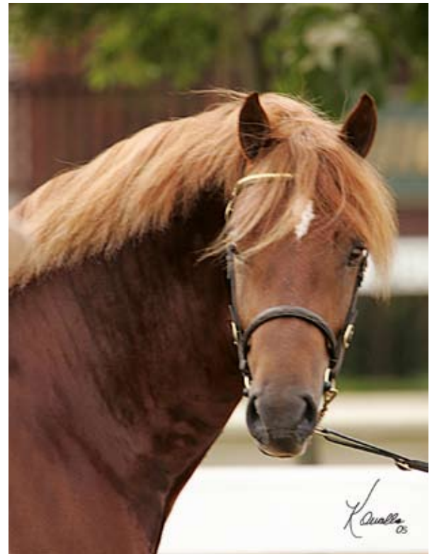
Section D Welsh Colt Goldhills Brandysnap - 2 years old.